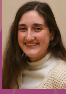
EMMA PITHER Chest of Drawers